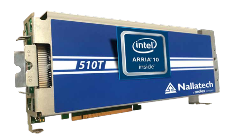
The 510T ships with Nallatech product branding.